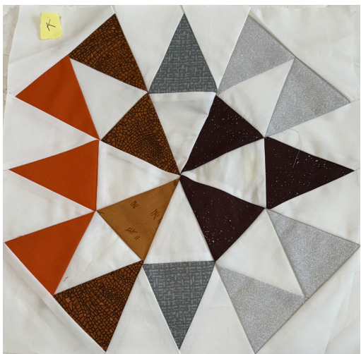
Block K examples in white and black color ways